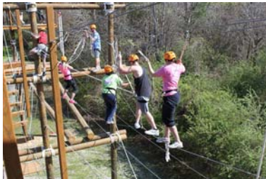
More rope climbing.