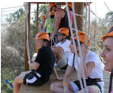
Enjoying the view from the top.

Miriam Klous had her article "Three-dimensional joint loading in alpine skiing: A comparison between a carved and a skidded turn" accepted for publication by The Journal of Applied Biomechanics .